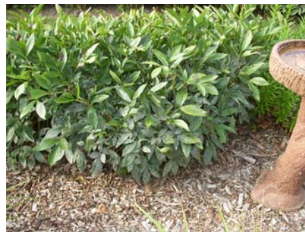
Powdery mildew on Peony

Control: Control is probably not necessary this late in the season. Fungicide applications should be made only for aesthetic reasons and are applied at the first signs of disease. Many products are labeled for control of powdery mildew; examples of active ingredients: copper, horticultural oil, myclobutanil, propiconazole, thiophanate-methyl, or triadimefon.