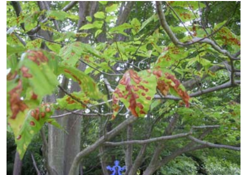
Anthracnose on American beech

Fungicide applications should be made in the early spring as leaves are developing. Products registered for use contain chlorothalonil, copper sulfate pentahydrate, mancozeb, or mancozeb + myclobutanil (MANhandle™). Injection treatments may be useful on larger specimens. Tebuject™ 16 is a Mauget® product labeled for injection treatments to control anthracnose diseases of ornamental trees.