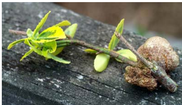
Agrobacterium gall on Euonymus