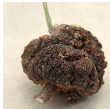
Agrobacterium gall on Euonymus close-up

Crown gall is caused by a soil inhabiting bacterium, Agrobacterium tumefaciens . The disease severity can vary depending on the host, but host mortality is usually caused by secondary pathogen invasion. Infected plants are also predisposed to drought and winter injury.