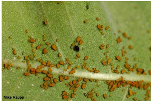
Black aphid mummy image – Oleander aphid colony showing black aphid mummies which were parasitized by a wasp in the genera Aphelinus .