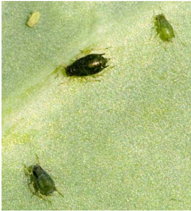
Sedum aphids found on sedum