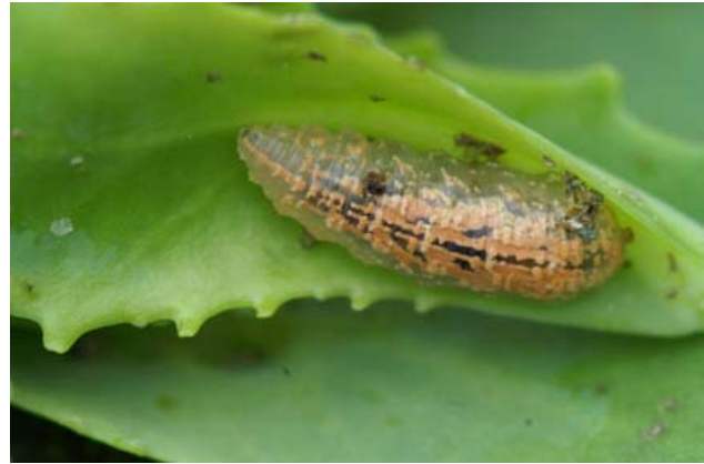
Syrphid fly larva that feeds on aphids. Coloration depends on host species.