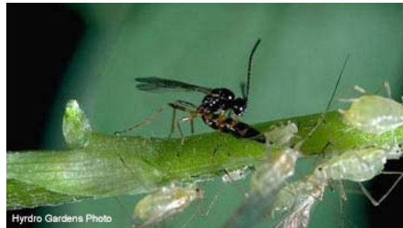
Adult wasp image – Aphidius adult wasp ovipositing into an aphid.