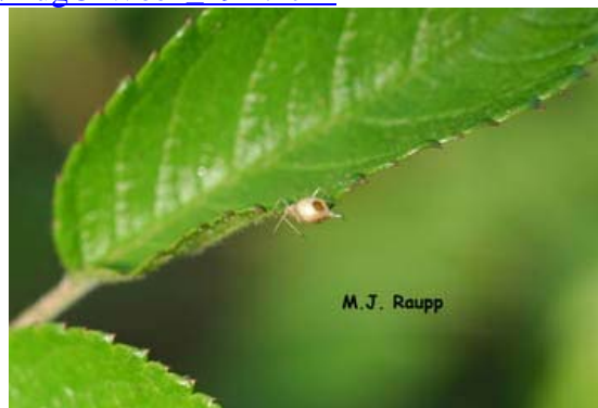
Tan aphid mummy with hole image – Rose aphid mummy showing the circular hole formed when the adult parasitic wasp emerges from inside.

Thank you to the Maryland Arborist Association, the Landscape Contractors Association of MD, D.C. and VA, Professional Grounds Management Society, Maryland Nursery and Landscape Association and FALCAN for your financial support in making these weekly reports possible. Photographs by Suzanne Klick, Stanton Gill or Shannon Wadkins unless otherwise noted. 5